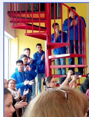
Sterling High School baseball team seniors provided gifts for car recipients.